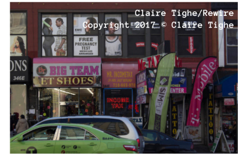
Shown above: a CPC in NYC advertising free pregnancy tests to lure people in.

Very often these CPCS are not actually licensed to provide health care and wont have any actual licensed medical staff on site. CPCS are evil and should be exposed!